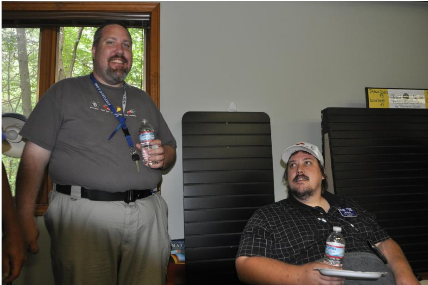
Orphaned twins are reunited, 30 years later, at ham radio event.